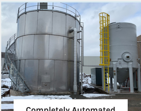
Completely Automated HANDS OFF APPROACH