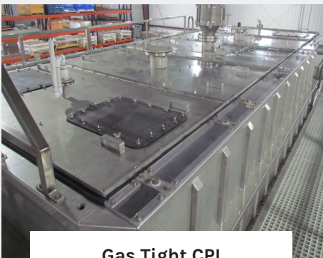
Gas Tight CPI NITROGEN OR GAS BLANKET