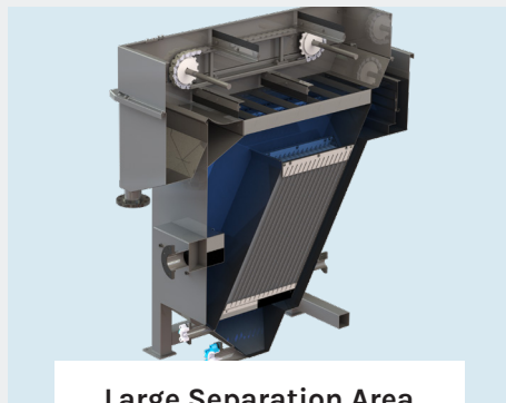
Large Separation Area COMPACT FOOTPRINT